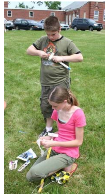
Students learned about the elements of a rocket engine and aerodynamics by assembling and launching their own model rockets.