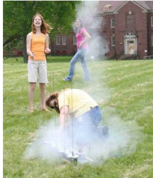
The thrill of a successful launch!

For more information about W-FL BOCES enrichment programs contact Staff Development at 585-394-9239 or mkirsch@wflboces.org .