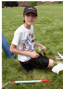
Figuring out how to make his rocket go higher by using strategies to calculate height with multiple tools and formulas.