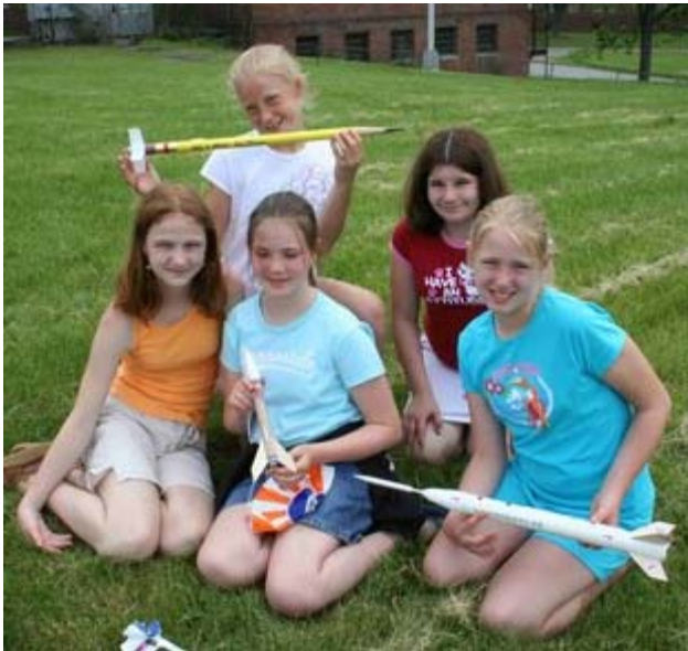
The Red Jacket Middle School girls prove that science and technology projects are girl-friendly too!