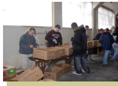
Students volunteering at FoodLink