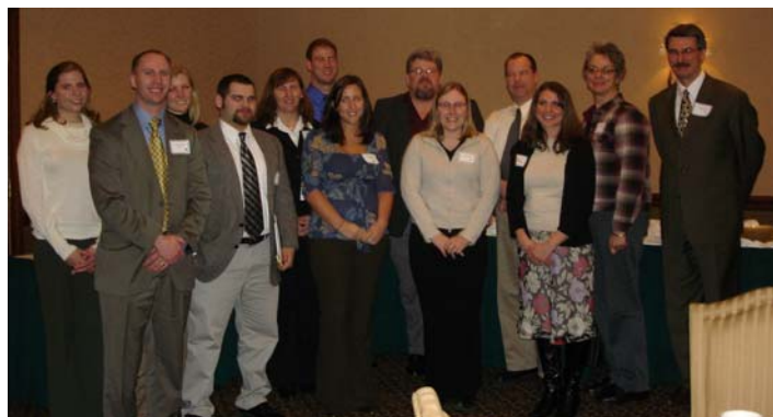
W-FL Leadership Institute Corhort #5 at the Canandaigua Inn on the Lake in January.