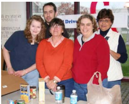
W-FL BOCES EduTech and Warehouse Staff collected more than one ton of canned and boxed food items donated by BOCES staff for FoodLink and area food cupboards during All Staff Day.

Staff honors were also given out at All Staff Day awarding exemplary service in the categories of Customer Service, Teamwork, Leadership and Individual Contribution. Retirees were also recognized and thanked for their years of service to W-FL BOCES.