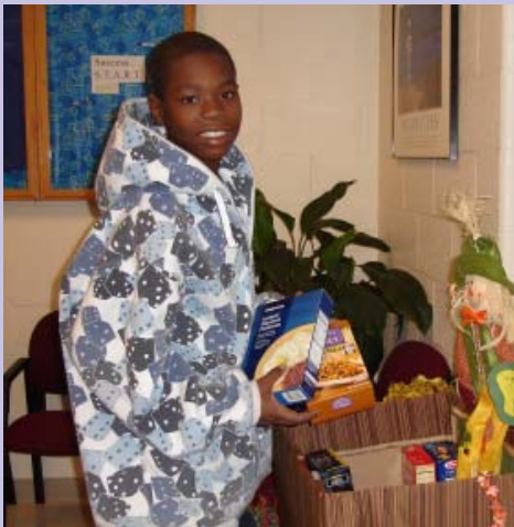
Staff and students at Wayne Education Center in Williamson held a food drive to benefit FoodLink of Rochester. They collected 72 assorted foods to donate. The students helped collect, count and decorate collection boxes for this activity.