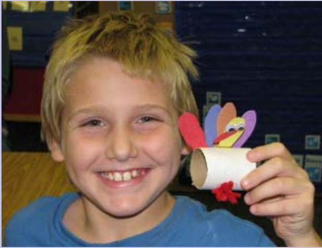
Everyone at Red Jacket Education Center enjoyed their annual Thanksgiving Holiday feast at school. The traditional turkey dinner and all of the fixings were prepared by staff and students.