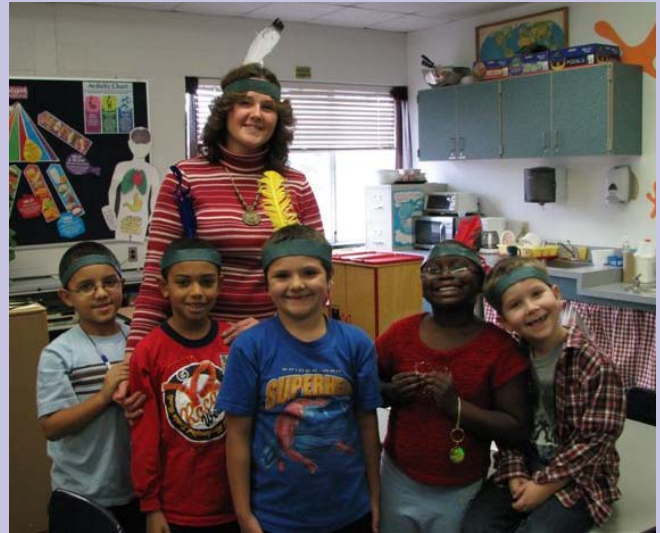
Red Jacket Education Center staff and students created headpieces while preparing for their annual Thanksgiving Celebration.