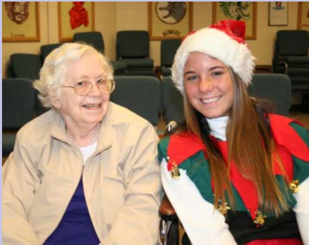
Wayne Tech and Career Center (WTCC) Criminal Justice students hosted a holiday "Day of Caring" for the residents of Newark Manor Nursing Home. Residents were treated to manicures, pedicures and haircuts by Cosmetology students and a holiday lunch prepared by Culinary Arts students.