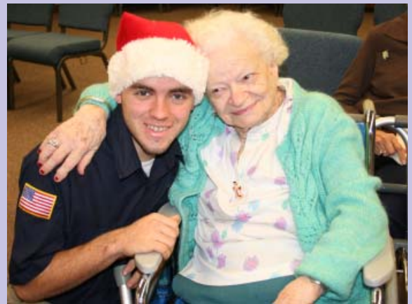
Students and staff from the WTCC Animal Science Program brought their pets to the holiday "Day of Caring" for the enjoyment of Newark Manor residents. The Marion High School Select Choir came to the tech center and performed a variety of holiday music for residents as well.