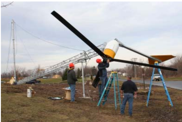
Contractors put the finishing touches on the blades of the WTCC wind turbine in January.

Wind Turbine or the Renewable Energy Program contact Craig Logan, WTCC Principal at 315-589-2600 or cloagan@wflboces.org .