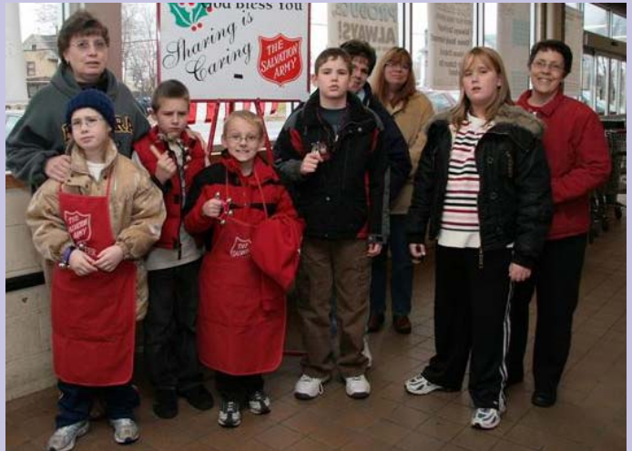
Red Jacket Education Center students helped give back to the community by ringing the bell for the Salvation Army's Red Kettle Campaign at Bliss Shurfine Food Mart in Shortsville.