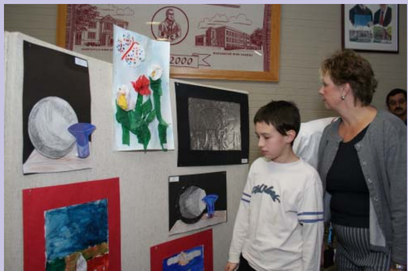
A student art exhibit was displayed at the Red Jacket Education Center's annual celebration of language and literacy. The theme of this year's event was "Winter's Delights" and included an elementary school vocal ensemble, middle school recorder ensemble and poetry created and read aloud by students.