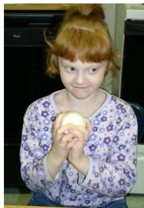
Students learned how to make and mold butter.

The staff and students at Red Jacket Education Center (RJEC) held their 9th annual Thanksgiving Feast in November and fed around 100 people more than 80 pounds of turkey! Gathered together at the table were RJEC staff, students and special adult guests invited to the feast by the students. The feast included turkey, dressing, corn, rolls, cider, milk and holiday cookies decorated by the students.