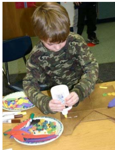
Students created handmade vests and headdresses to wear to the annual Thanksgiving Feast.

In addition to making the dessert, students created all of the decorations for the meal adding their special touches to the placemats, centerpieces, vests, necklaces and headdresses. Students also learned how to make butter and each prepared a container for the Thanksgiving table.